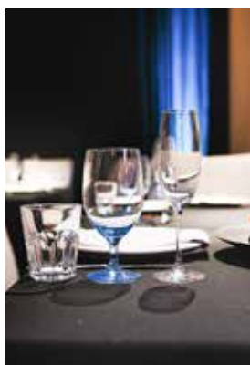
Table Linens and Napery