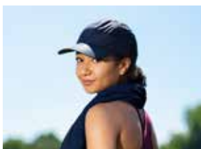
Hand towels and wash cloths make great chill towels